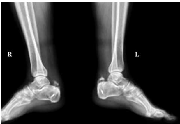
Figure 6. Postoperative X-rays of the left and right ankles.

Before operation, the patient's AOFAS (American Orthopaedic Foot and Ankle Society) score 10 was 92/100.