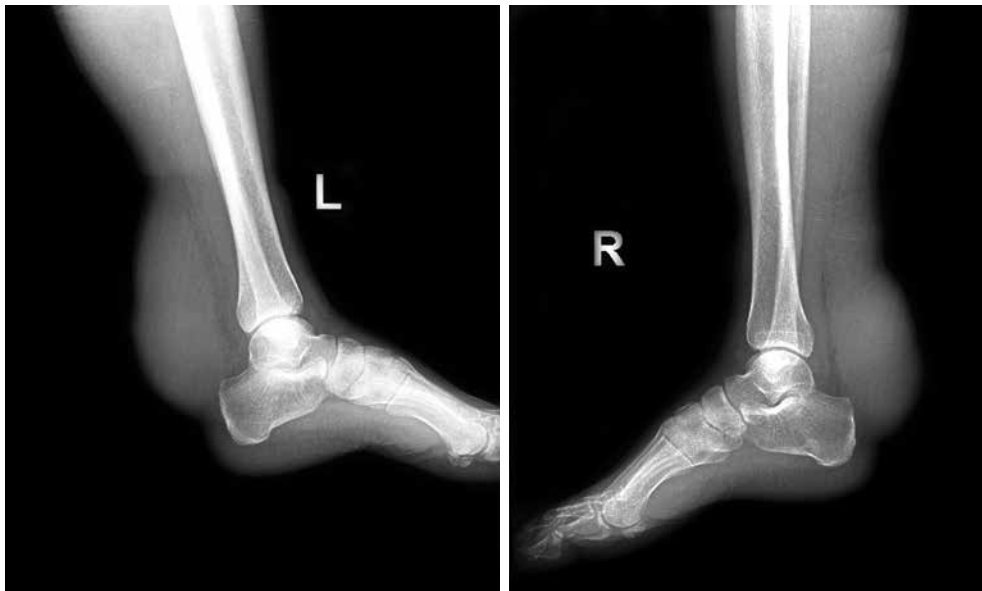
Figure 1. Preoperative X-rays of the left and right ankles. Soft tissue density masses can be seen in both ankles.

by a mutation of the sterol 27-hydroxylase gene (CYP27) resulting in the accumulation of cholesterol and cholestanol. [1]