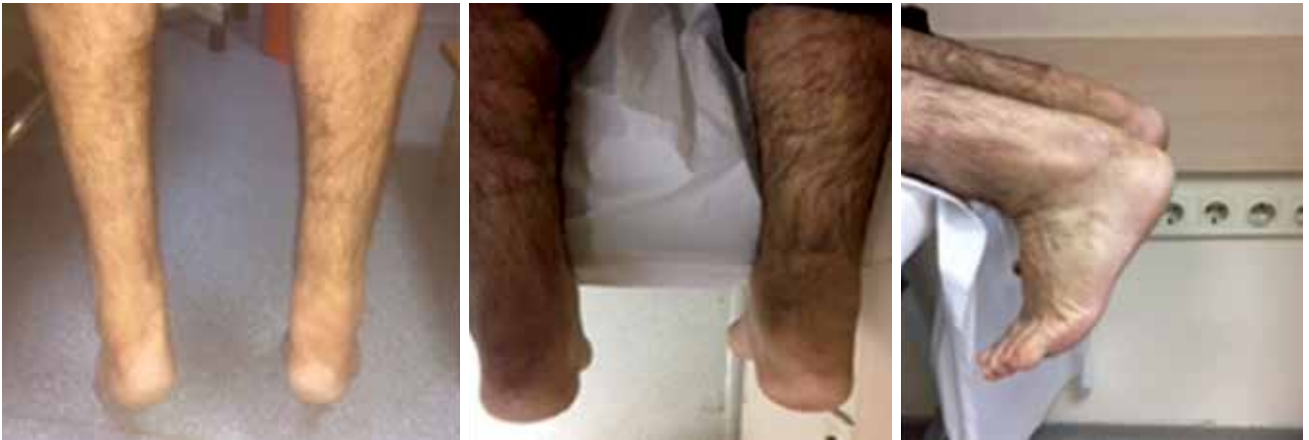
Figure 5. Photos from the second year follow-up examination. The patient could stand on his tiptoes on both sides.

and were progressive. Dorsiflexion was limited in both ankles. Both feet had Stage 1 cavus deformity and the swellings had no ulcers. The patient could walk about 300 meters. A review of the patient's history revealed no classical symptoms of CTX, such as a cataract surgery or chronic diarrhea, nor any neurological pathology. However, the patient had a familial history of FH. His parents were first-degree relatives. The patient had a sister and two brothers, one of them had small sized xanthomas on his ankles and hands. The patient was diagnosed with bilateral Achilles tendon xanthoma secondary to FH using magnetic resonance imaging (MRI). The diagnosis was confirmed with bilateral closed tru-cut biopsy performed under sedation analgesia in the operating room. The patient had a short-stepping gait. There was no heel to toe progression. A written informed consent was obtained from the patient.