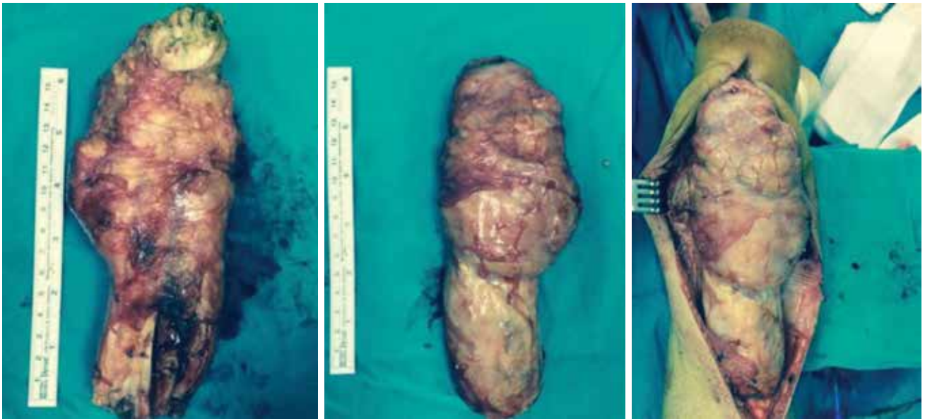
Figure 3. Masses resected from the left (the larger mass) and right ankles. Intraoperative appearance of the mass in the right ankle.

difficulty walking. Extended surgical approaches are often required. In order to minimize the disintegration of the xanthomatous mass surrounded by a capsule, gentle and blunt dissection should be performed. Extended approaches enable better exposure of xanthomas.