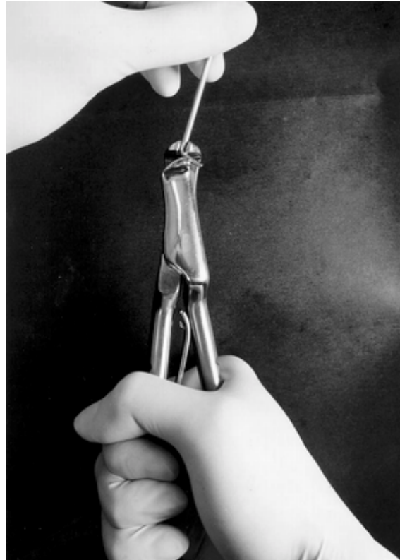
Resim 2: View of the forceps during bending the Kirschner wire.

bone is not damaged. Also, the forceps does not loosen the wire as the classical methods do, and reduces the risk of symptomatic prominence of the Kirschner wires, skin breakdown and infection.