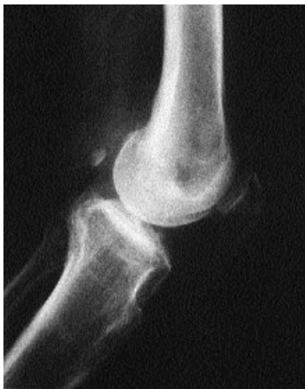
Fig. 4. Lateral radiograph of the left knee 40 months after surgery. The eroded regions of the inferior pole of the patella and the superior margin of the tibial tuberosity are still visible.