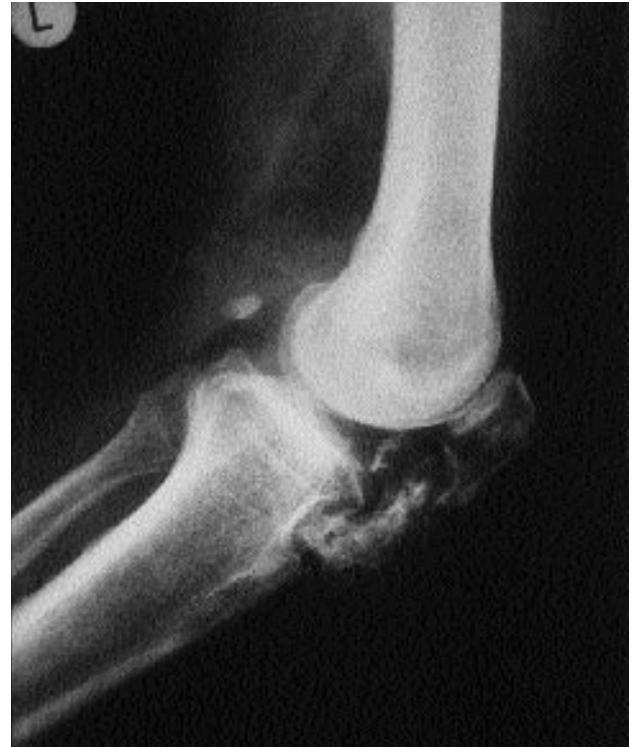
Fig. 1. Preoperative lateral radiograph of the left knee showing a large ossified lesion at the anatomical site of the patellar tendon, with signs of erosion to the inferior pole of the patella and superior margin of the tibial tuberosity.

At his last follow-up control in the 40th postoperative month, the patient had minimal pain on the medial side of the knee joint and a full range of motion. No recurrence was detected clinically or radiographically (Fig. 4). The residual pain was thought to be related to degenerative arthritic changes.