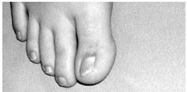
Fig. 4. After six months, healing with excellent cosmetic appearance.