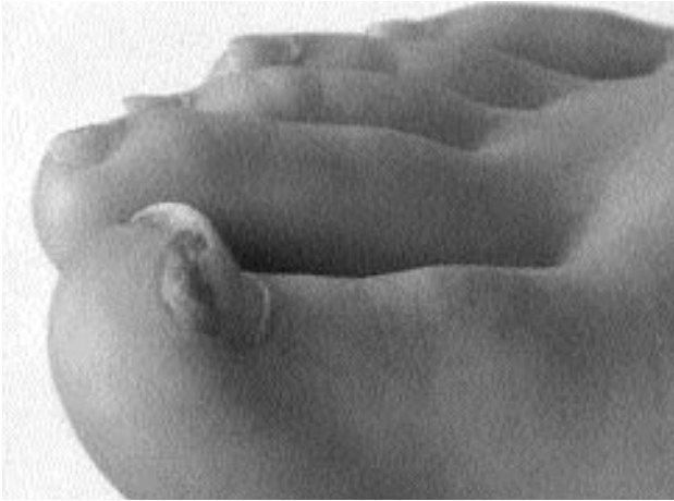
Fig. 1. Subungual lesion in the big toe.

weeks. With removal of the stitches after two weeks, the patient could gradually return to normal-width shoes.