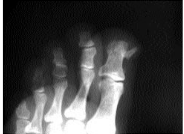
Fig. 2. Radiograph of the subungual osteochondroma.

Osteochondromas can easily be misdiagnosed. The differential diagnosis includes benign lesions such as onychomycosis, verruca vulgaris, subungual fibroma, glomus tumor, pyogenic granuloma, subungual digital mucous cyst, and enchondroma, and malignant lesions such as osteosarcoma, squamous cell carcinoma, and malignant melanoma. [6,7] Radiographically, osteochondromas present as an exophytic bony growth protruding from the dorsal surface of the distal phalanx. A dorsoplantar radiograph may not demonstrate the lesion, but a lateral or oblique radiograph frequently enables the diagnosis. [7,8] Our patient had previously received treatment in two centers with two different diagnoses, which were verruca vulgaris and pyogenic granuloma, respectively. Finally, she sought treatment at our center with a deformed nail in her big toe. Clinical findings were consistent with osteochondroma and