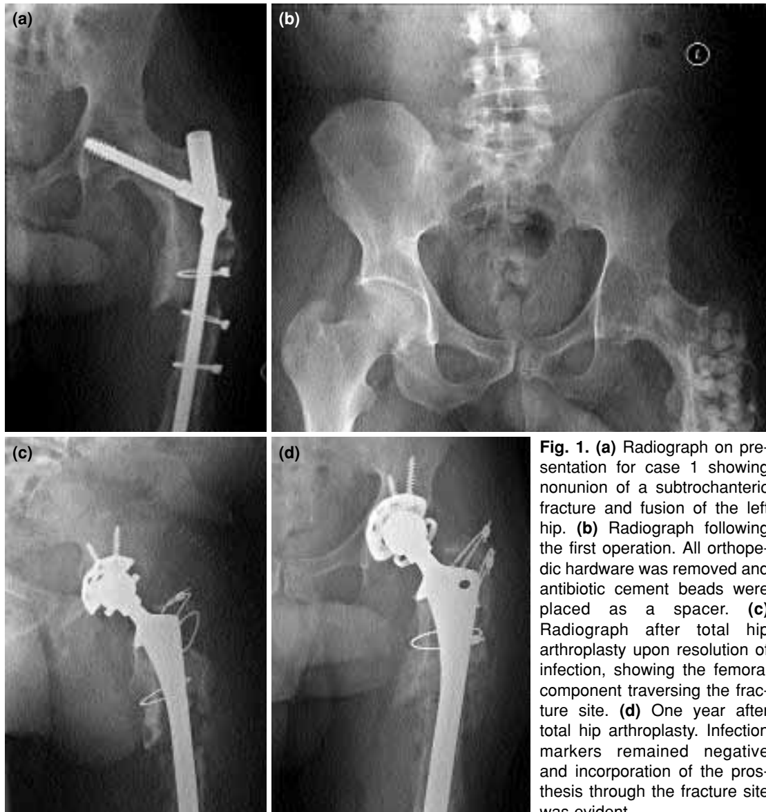
Fig. 1. (a) Radiograph on presentation for case 1 showing nonunion of a subtrochanteric fracture and fusion of the left hip. (b) Radiograph following the first operation. All orthopedic hardware was removed and antibiotic cement beads were placed as a spacer. (c) Radiograph after total hip arthroplasty upon resolution of infection, showing the femoral component traversing the fracture site. (d) One year after total hip arthroplasty. Infection markers remained negative and incorporation of the prosthesis through the fracture site was evident.

and nuclear medicine scans were consistent with an infected nonunion of the fracture. Upon diagnosis, the patient was taken to the operating room for irrigation and debridement of the hip, removal of hardware and placement of antibiotic beads (Fig. 1b). Cultures from the operation site grew Staphylococcus aureus and the patient received a six-week course of intravenous antibiotics. Resolution of the infection was monitored with serial infection labs and nuclear medicine studies. Upon normalization of laboratory and scintigraphic findings, the patient returned to the operating room for a conversion of the hip arthrodesis to a noncemented, distal filling, total hip arthroplasty (Fig. 1c). Intraoperative frozen