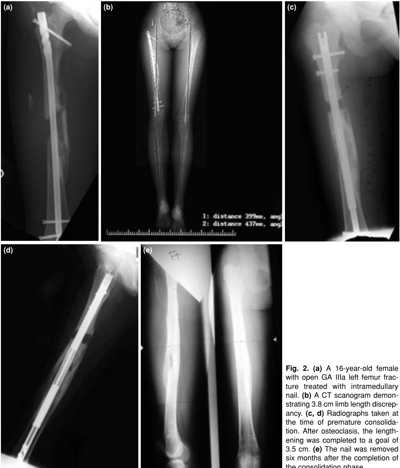
Fig. 2. (a) A 16-year-old female with open GA IIIa left femur fracture treated with intramedullary nail. (b) A CT scanogram demonstrating 3.8 cm limb length discrepancy. (c, d) Radiographs taken at the time of premature consolidation. After osteoclasis, the lengthening was completed to a goal of 3.5 cm. (e) The nail was removed six months after the completion of the consolidation phase.

procedures were performed by senior surgeons (AG, DF, KE) having extensive experience with limb lengthening techniques. Patients were not discharged from the hospital until they had been trained in the use of the ISKD monitor (an elec-