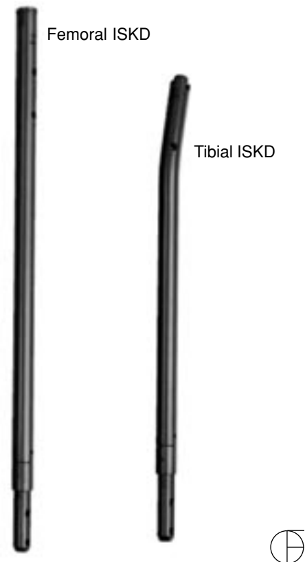
Fig. 1. Internal skeletal distractor (ISKD) implants for the femur and tibia.

A retrospective review was undertaken of all patients who underwent femoral lengthening using the ISKD device beginning September 2003 at our tertiary care center. The ISKD procedures were performed in accordance with the manufacturer's recommendations. All intramedullary devices were placed in an antegrade fashion through a piriformis starting point after the creation of the diaphyseal osteotomy. Osteotomies were created by making multiple drill holes in the diaphysis of the femur with a 3.5-mm drill. The drill holes were connected using an osteotome, and finally the completion of the osteotomy was confirmed to be complete with biplanar stress fluoroscopy. All limb lengthening