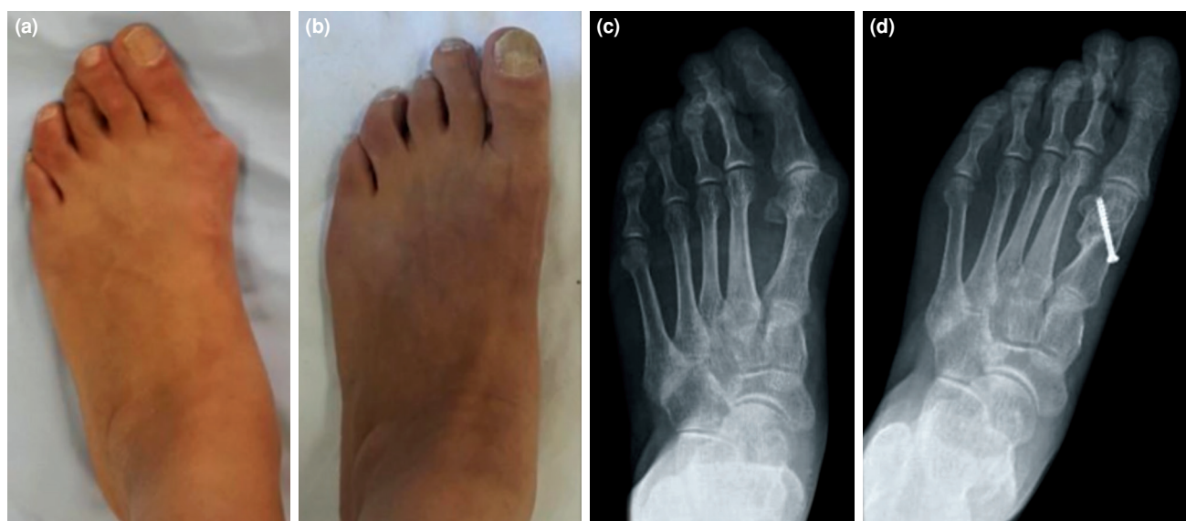
FIGURE 3. Fifty-one year old woman operated for hallux valgus deformity. (a) Preoperative AP weight-bearing view. (b) Postoperative AP weight-bearing view at last visit. (c) Preoperative AP weight-bearing X-ray. (d) Postoperative AP weight-bearing X-ray at last visit.