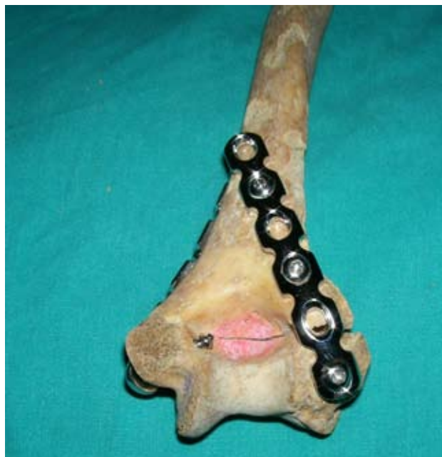
Figure 1. Fixation of the osteotomy site using double plate osteosynthesis. Single screw in the distal fragments was used.

Materials Testing Machine (model TIRA test 24500; Demgen, Werkzeugbau, GmbH, Nordrhein-Westfalen, Germany) was used for mechanical testing (Figure 3). All specimens were loaded to their