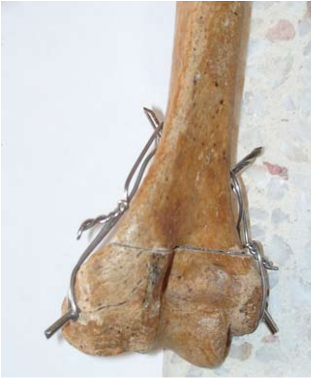
Figure 2. Fixation of the osteotomy site using double tension band osteosynthesis technique.

failure point at a static rate of 40 mm/minute and force versus displacement data was recorded. The force which produced a 3 mm gap (gap load) as detected visually with the aid of operating loupes and the maximum force prior to failure of the con-