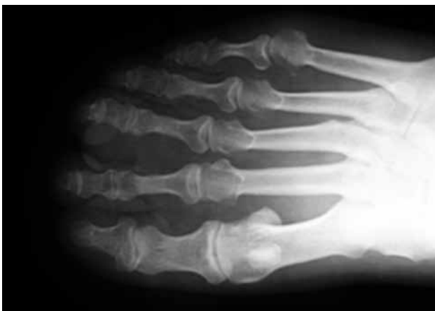
Figure 2. Radiography showing the soft tissue shadow, no bony involvement.

Milgram et al. [9] reported a massive fibrolipoma of a toe and Pirela-Cruz et al. [10] reported a lipoblastoma that contained immature fat cells involving the second toe. Lisch et al. [11] reported a lipoma that completely involved the fourth digit of the foot. Vandeweyer et