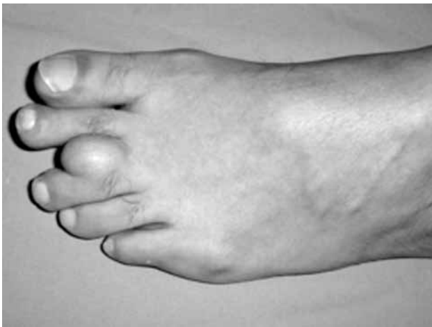
Figure 1. Clinical view of the soft-tissue mass in the second web space.

revealed a lipoma characterized by mature adipocyte clusters separated by well-vascularized collagen bundles showing myxoid degeneration (Figure 5). The postoperative healing was uneventful. At three month's follow-up, there was no hypoesthesia and no mechanical discomfort and the patient could wear proper footwear.