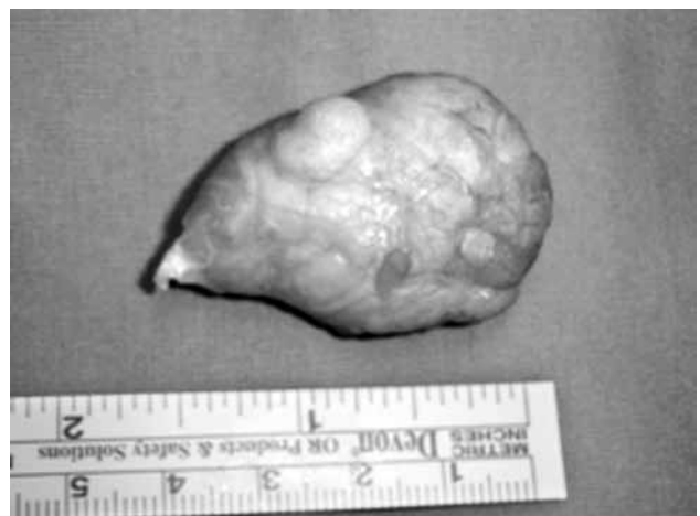
Figure 4. Well-defined, encapsulated mass after excision.