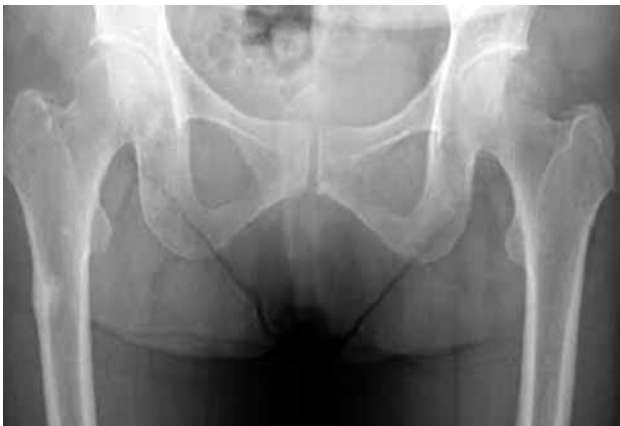
Figure 1. Anteroposterior radiogram showing thickened lateral cortex of subtrochanteric area.

atypical femoral fractures related to zoledronate usage were reported in patients who suffer prostate and breast cancer. [12,13]