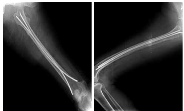
Figure 3. Anteroposterior and lateral radiograms showing prophylactic internal fixation with titanium elastic nails.

American Society for Bone and Mineral Research suggested various criteria to help diagnosing atypical femoral fractures. [17] These fractures occur in the proximal femoral diaphysis or subtrochanteric area. There is thickening at the lateral cortex but transverse or short oblique fracture line can be seen and medial with a "spike" if the fracture extends to the medial cortex. This view at the