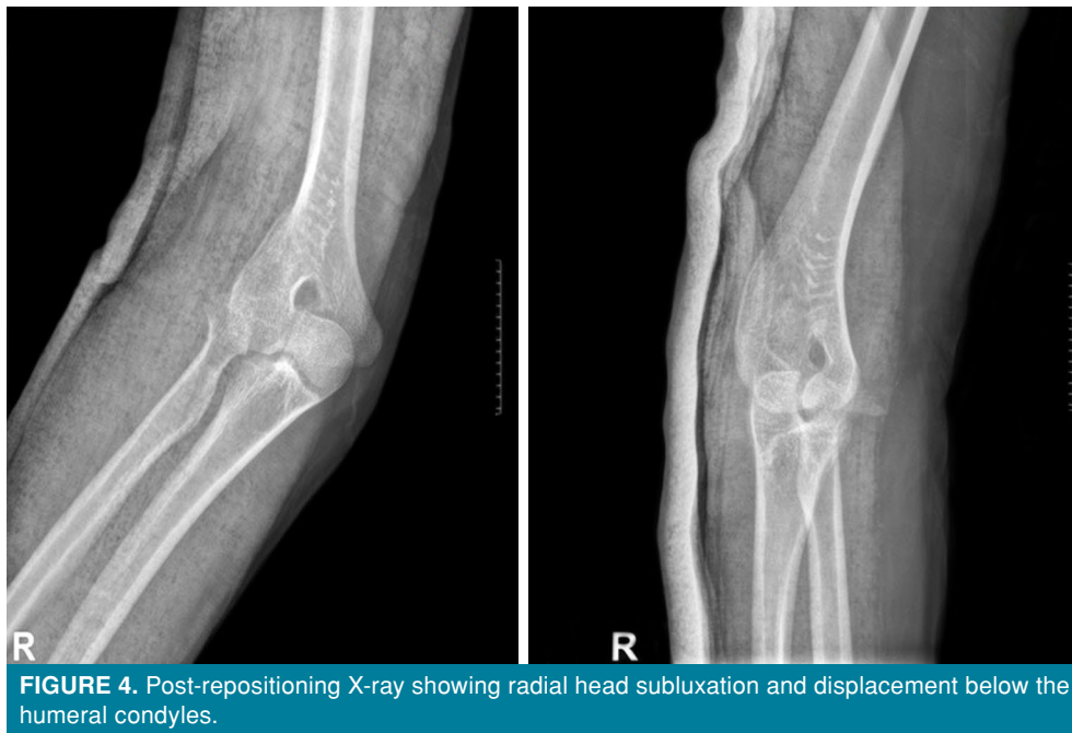
FIGURE 4. Post-repositioning X-ray showing radial head subluxation and displacement below the humeral condyles.

and limited range of right elbow motion (5 to 70°) were noted. Repeated X-ray did not reveal any changes in clinical findings (Figure 6). The patient was advised to exercise at home three times a day, including extreme flexion and extension for 5 to 10 sec after the hot application, and there were no obvious complaints of discomfort during this process. At six months of follow-up, the active range of right elbow motion included hyperextension of 5 to 115°, pronation of 80°, and supination of 45° relative to neutral (Figure 7). The patient revealed that the previous level of elbow joint function was