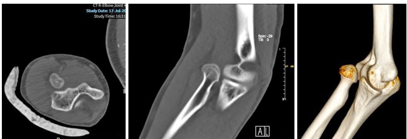
FIGURE 5. Post-repositioning computed tomography showing subluxation of the radial tuberosity, as well as a pencil-shaped radial head forming a pseudo-joint with the humeral tuberosity.

Radial head subluxation is the most common developmental anomaly of the elbow; it may occur unilaterally or bilaterally. [1,6] Isolated radial head dislocation can occur during birth or postoperatively in patients with dislocated Monteggia fractures, ulnar varus, or other conditions. [7] Most of these patients exhibit normal radial head morphology. [8] However, patients with congenital