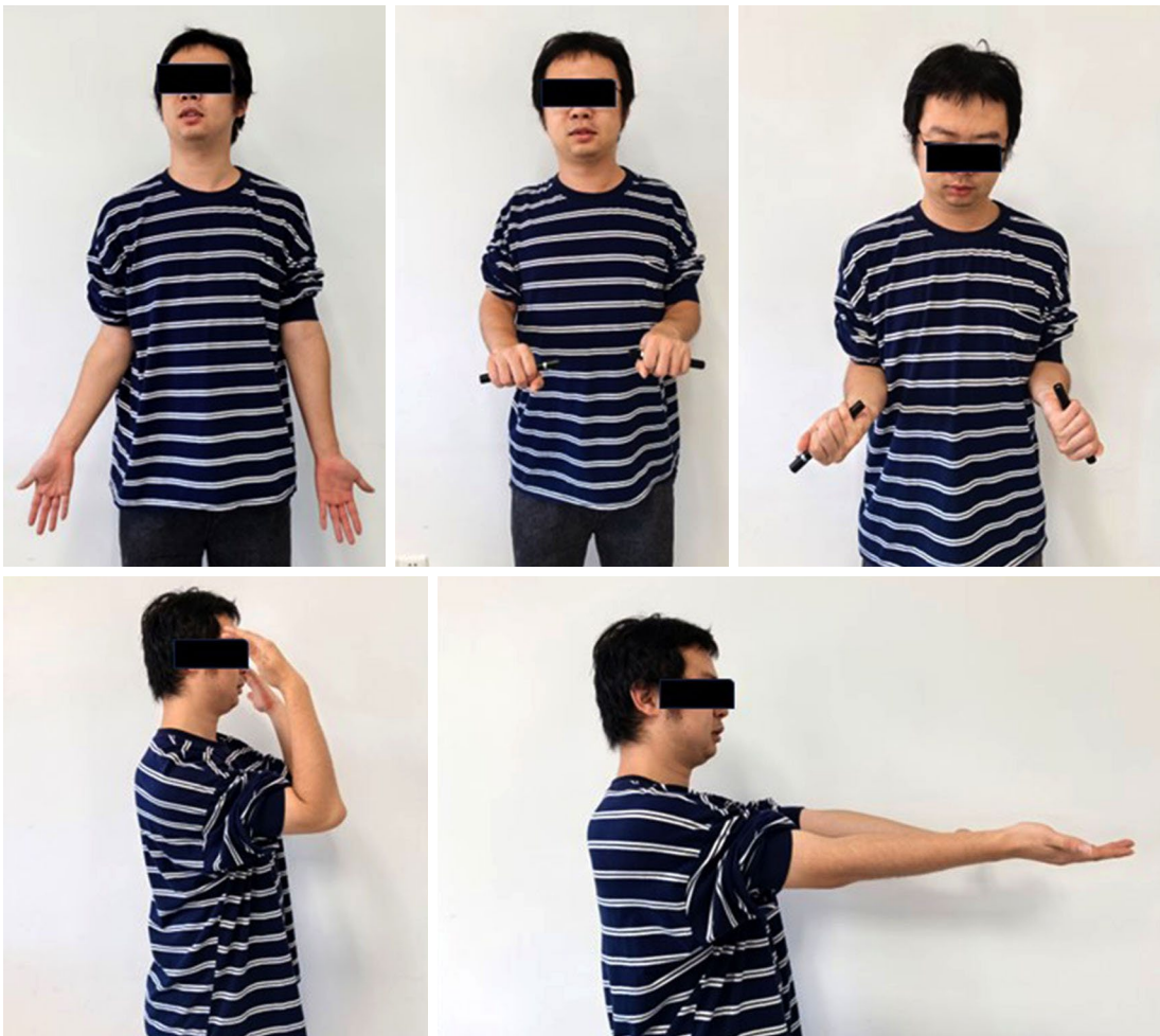
FIGURE 7. At 6 months after treatment, the patient had ranges of motion comprising 5 to 100° for flexion and extension and 80 to 50° for anterior and posterior rotation.