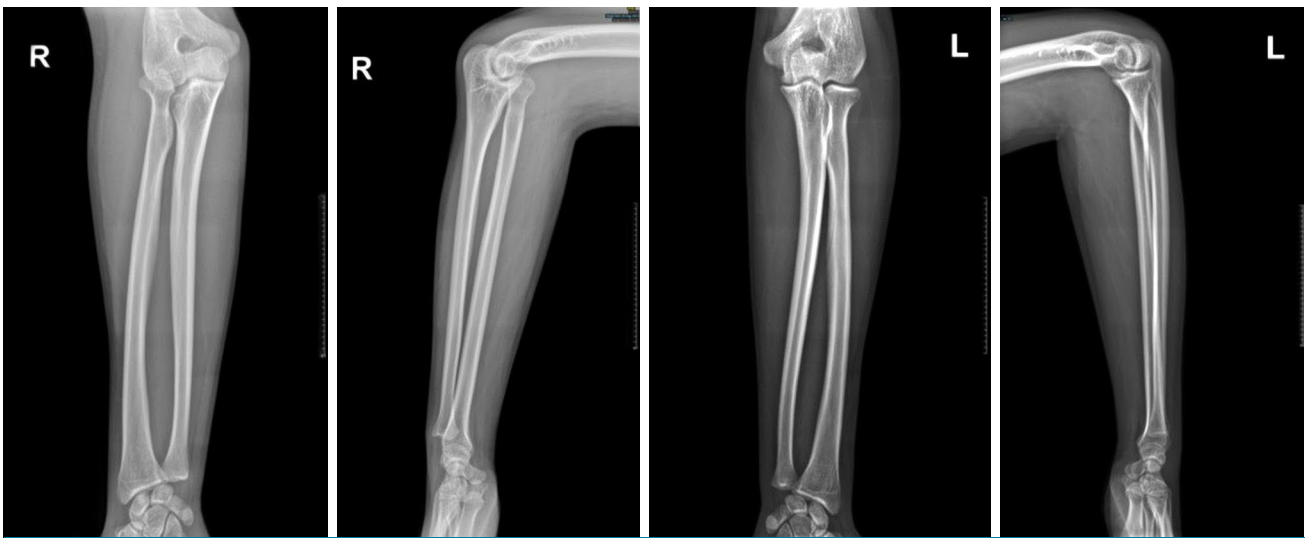
FIGURE 6. At 3 weeks after treatment, X-ray showed subluxation of the right radial tuberosity and normal morphology of the left radial tuberosity.