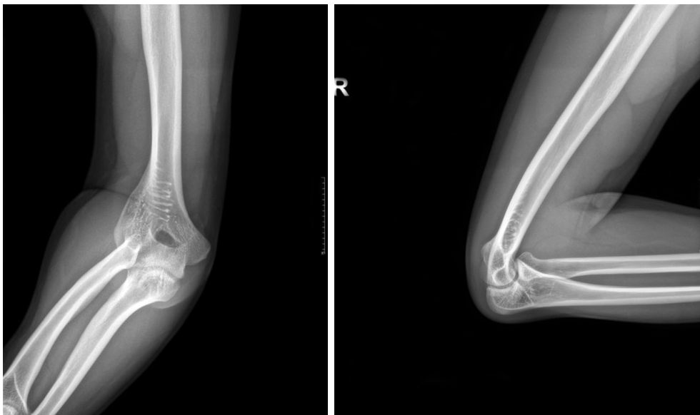
FIGURE 1. Anteroposterior and lateral X-rays showing anterior dislocation of the radial tuberosity and abnormal radial head morphology.