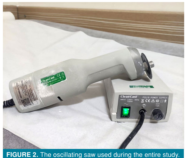
FIGURE 2. The oscillating saw used during the entire study.