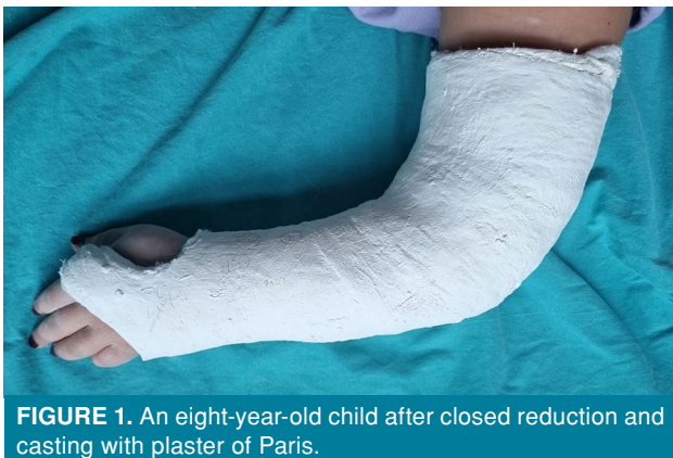
FIGURE 1. An eight-year-old child after closed reduction and casting with plaster of Paris.

Data were analyzed using IBM SPSS version 23.0 software (IBM Corp., Armonk, NY, USA). Descriptive statistics were expressed as mean \pm standard