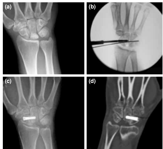
Figure 1. (a) Preoperative anteroposterior X-ray view. (b) Insertion of guide wire and screw under image intensifier between scaphoid and capitate bone. (c) Postoperative anteroposterior X-ray view at sixth month. (d) Postoperative computed tomography view at ninth month.