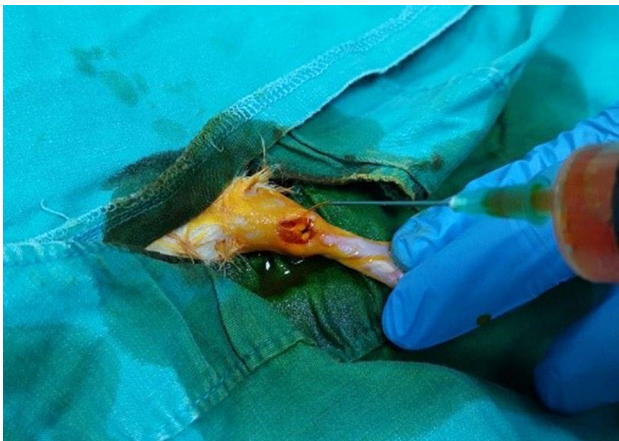
FIGURE 1. Irrigation with 0.05% rifampicin solution following the repair of the Achilles tendon.

The modified scoring system developed by Svensson, Soslowsky, and Cook is notable for its comprehensive inclusion of cartilage formation as a key parameter alongside traditionally accepted factors, such as fiber structure, cellularity, and vascularity, among other existing classifications.