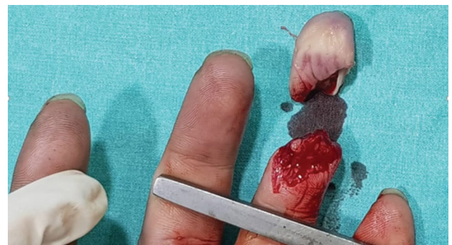
FIGURE 2. Allen type IV finger amputation.

The soft tissues of the pulp in the amputate were excised so that the bone and nail bed complex remained in the amputated part. Except for the cortex