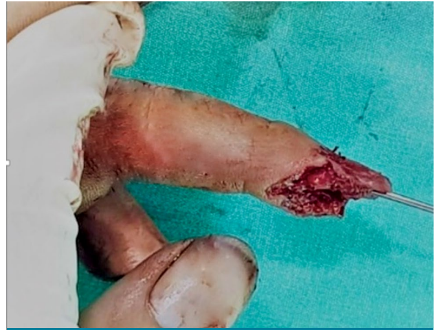
FIGURE 5. Fixation of the amputated bone and nail bed to the stump.

under the nail bed surface, all other bone surfaces were decorticated thinly with the aim of better adhesion of the flap to the bone (Figures 2-4). Bone ends in the amputate and stump were shortened nearly 1 to 2 mm in a controlled manner to clean the fracture surfaces. After the soft tissues were excised,