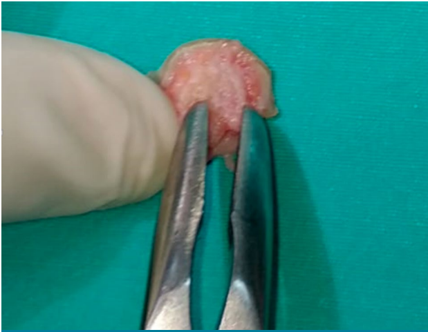
FIGURE 4. Decortication of volar face of the amputated bone.