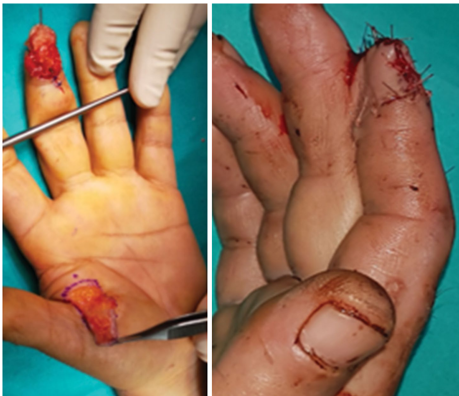
FIGURE 6. After fixation and nail bed repair, coverage with thenar or cross finger flap.

the amputated part consisting of the nail bed and bone, which would be used as a graft, was fixed to the stump with one or two K-wires or injector nail, without passing through the distal interphalangeal (DIP) joint (Figure 5). After nail bed repair, the coverage was provided with a cross finger or thenar