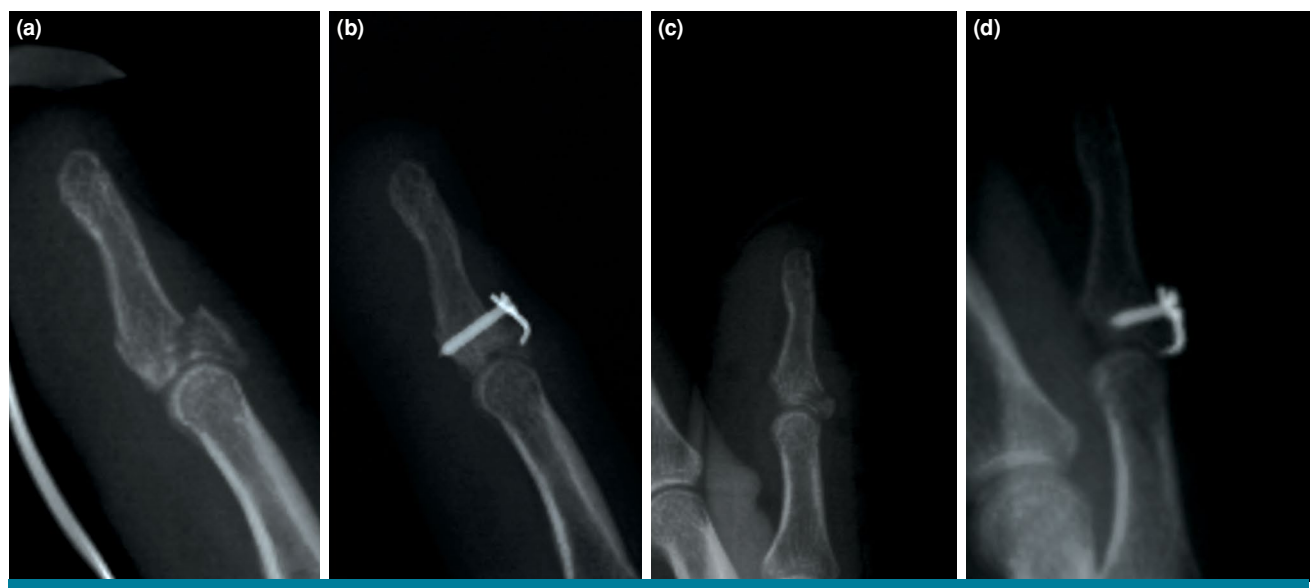
FIGURE 4. Preoperative and postoperative radiographies of patients with different fracture patterns. ( a , b ) Preoperative and postoperative lateral radiography of Patient 8. ( c , d ) Preoperative and postoperative lateral radiography of Patient 9.

were statistically significantly lower in the EBT group.