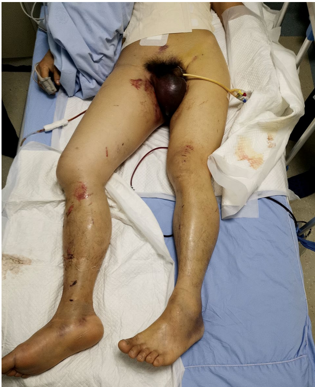
FIGURE 1. The picture of general appearance after the injury.

the fracture fragment in the posterior wall of left acetabular was successfully reduced. Three weeks after the injury, the left acetabular anterior wall fracture was treated with open reduction and internal fixation (Figure 3). After the operation, the patient received physical therapy in bed including quadriceps strengthening exercises and active range of motion. The left hip pain was relieved successfully after surgery.