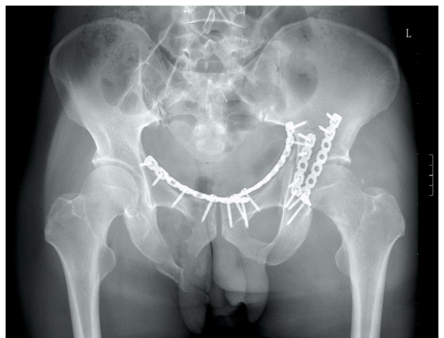
FIGURE 3. Postoperative anteroposterior radiograph of the pelvis showing bilateral hip joints in place and good reduction of acetabular fractures.