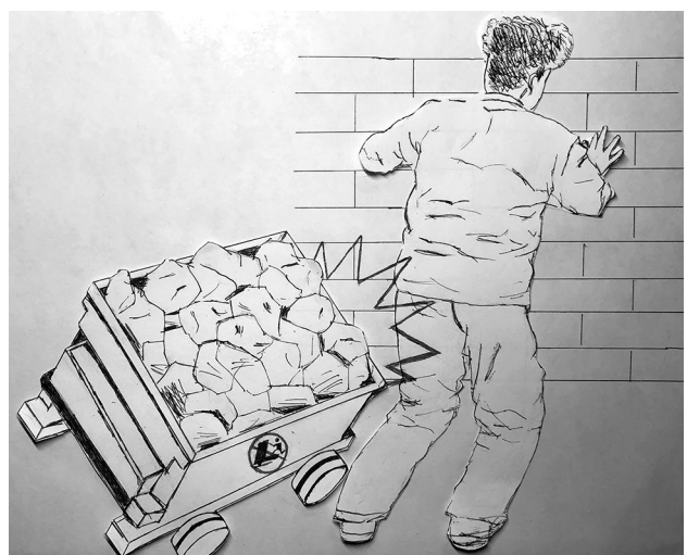
FIGURE 4. Schematic diagram of the patient's injury mechanism.

Once associated injuries are ruled out, reduction should be performed as soon as possible under general anesthesia or conscious sedation. If full muscular sedation is available in a safe manner in the emergency room and there are no other contraindications to attempted reduction; e.g., femoral neck fracture or acetabulum fracture, and reduction can be performed in a safe and timely manner in the emergency room setting. [10] The current main view is that hip dislocation should be reduction within 6 h as far as possible, and at least within 24 h. The earlier reduction, the risk of avascular necrosis of the femoral