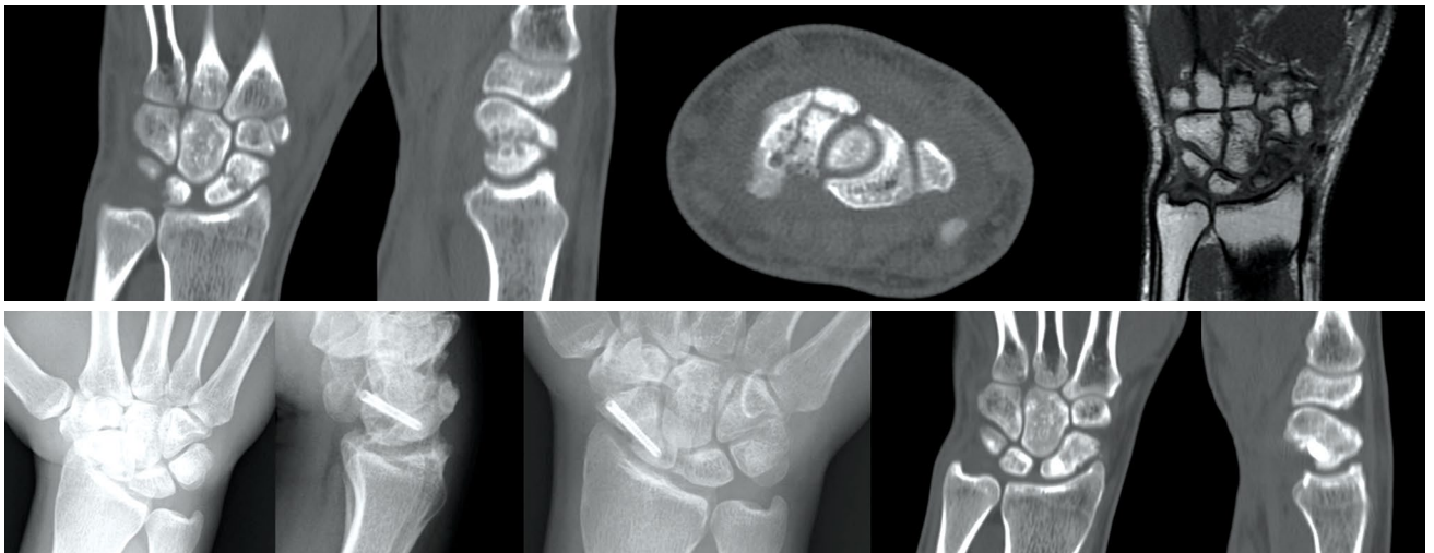
FIGURE 2. A 28-year-old male with scaphoid waist nonunion. The MFC bone graft was used in this patient. Preoperative coronal, sagittal, axial CT images and T1- coronal MRI and the postoperative X-rays and CT images at two years after surgery.

MFC: Medial femoral condyle; CT: Computed tomography; MRI: Magnetic resonance imaging.