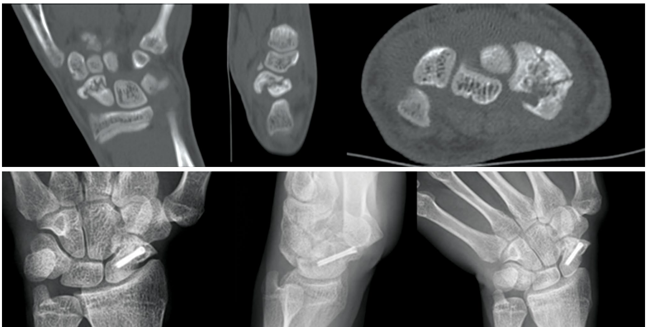
FIGURE 3. A 20-year-old male with scaphoid waist nonunion was treated with an IC-NBG. Preoperative coronal, sagittal, axial CT images and the postoperative X-rays at two years after surgery.

was larger than the defect, was formed into a wedge or trapezoid shape, trimmed and placed in the defect. The descending genicular artery was anastomosed to the radial artery in an end-to-side fashion, and a concomitant vein was anastomosed to a radial vein comitantes or a superficial vein in an end-to-end fashion.