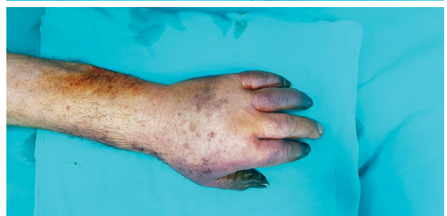
FIGURE 3. Clinical appearance before amputation.