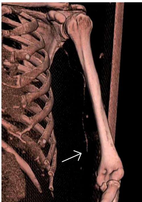
FIGURE 2. A computed tomography angiography image before the first thromboembolectomy.

An incision was made in the left antecubital region under the infraclavicular block. After the radial and ulnar arteries were explored, arteriotomy was performed. Distal and proximal thrombectomy was performed using a 3-Fr Fogarty® catheter. An abundant organized thrombus material was removed. The upper extremities were palpated to detect distal pulses, and cyanosis in the hand began to decrease. Heparin infusion was started, and the patient was transferred to the ICU. Cyanosis in the hand increased again