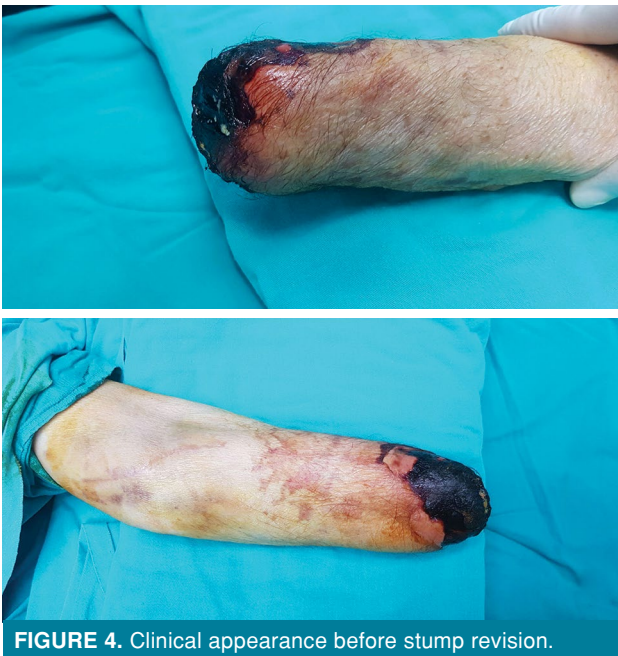
FIGURE 4. Clinical appearance before stump revision.

wound site. Stump revision was planned for the patient (Figure 4). After receiving a negative polymerase chain reaction result for COVID-19 and completing COVID-19 treatment, the patient was transferred to the orthopedics and traumatology clinic. Stump revision was performed under infraclavicular block 22 days after the first amputation, and the amputation level was raised to the proximal forearm level. The patient whose wound site was clean during the ward follow-up was discharged with recovery on Day 10 after surgery. No complications were observed during follow-up in the postoperative three weeks.