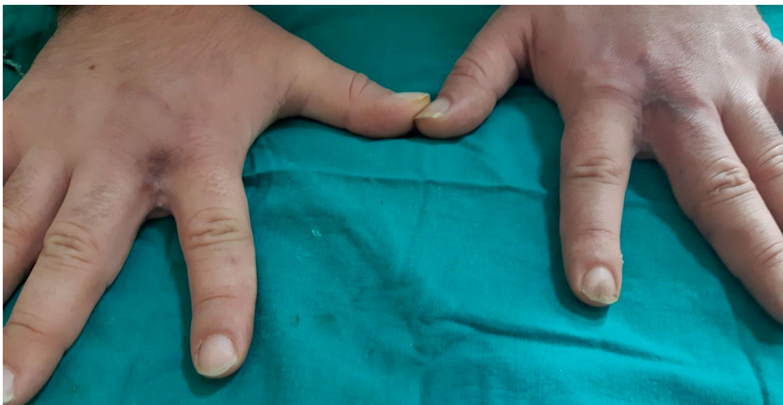
FIGURE 3. Appearance of excised regions four years after operation.