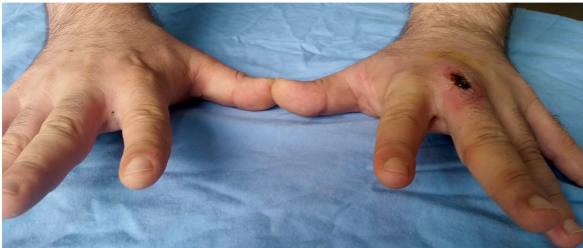
FIGURE 1. Image of bilateral pilonidal sinus at the second web showing external openings and there is an ulcerative lesion in dorsal side of the left middle finger.