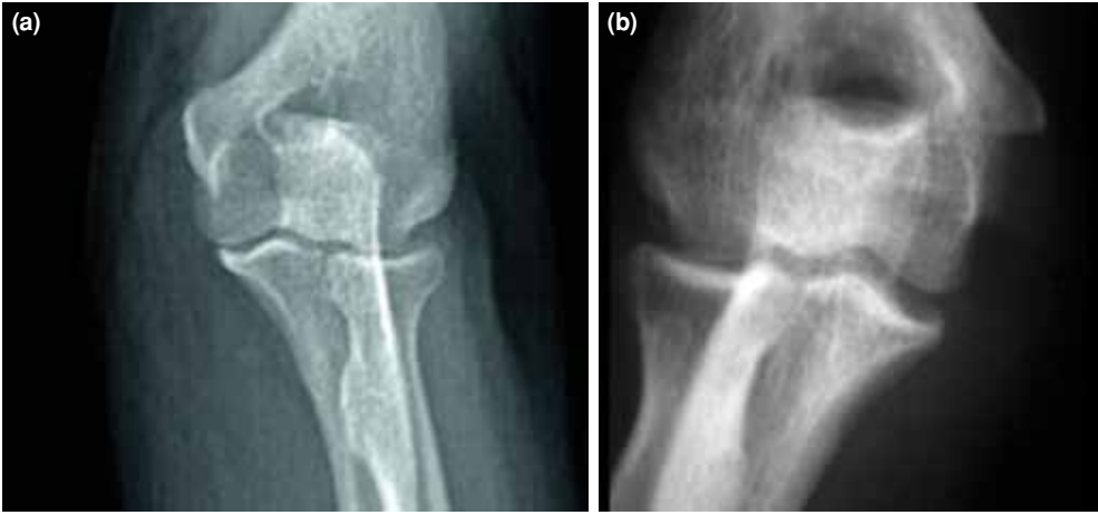
Figure 3. Postoperative sixth month anteroposterior radiography of patients. (a) Partial medial epicondylectomy group, (b) distal medial epicondylectomy group.

Elbow anteroposterior and lateral radiographies were obtained preoperatively to rule out any signs of previous elbow trauma, fracture or osteoarthritis. The radiographies were obtained postoperatively to examine the osteotomy sites. Last radiographic checks were performed at sixth month (Figure 3). The patients were clinically assessed preoperatively and at postoperative third, sixth and 12th months. On pre- and postoperative checks, the patients were clinically examined for Tinel's sign on cubital tunnel, local tenderness over the medial epicondyle, nerve subluxation with elbow motion, varus-valgus and total joint instability. Objective assessment was performed with Goldberg's modification[12] of McGowan grading system<sup>[13]</sup> (Table II) and Wilson Krout Scores (WKS).[14] Sensory status of the patients was assessed with Semmes-Weinstein monofilament (SWM) test. Motor function of the ulnar nerve was evaluated with grip strength (GS) and pinch strength measurements of terminal pinch (TP), tripod grip (TG), lateral or key pinch (LP) (Baseline Hydraulic Hand Dynamometer and Baseline Hydraulic Pinch Meter, Fabrication Enterprises Inc., Irvington, NY, USA) in comparison to other normal side only for unilateral cases.