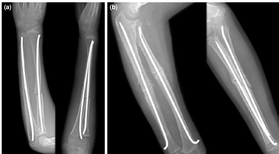
FIGURE 2. Examples of delayed union. (a) Eight-week radiographs of a delayed union patient and (b) 12-week radiographs of a delayed union patient.

there was a slight difference in the total mRUST and RUST scores at the eight-week follow-up radiographs among surgeons with different experiences.