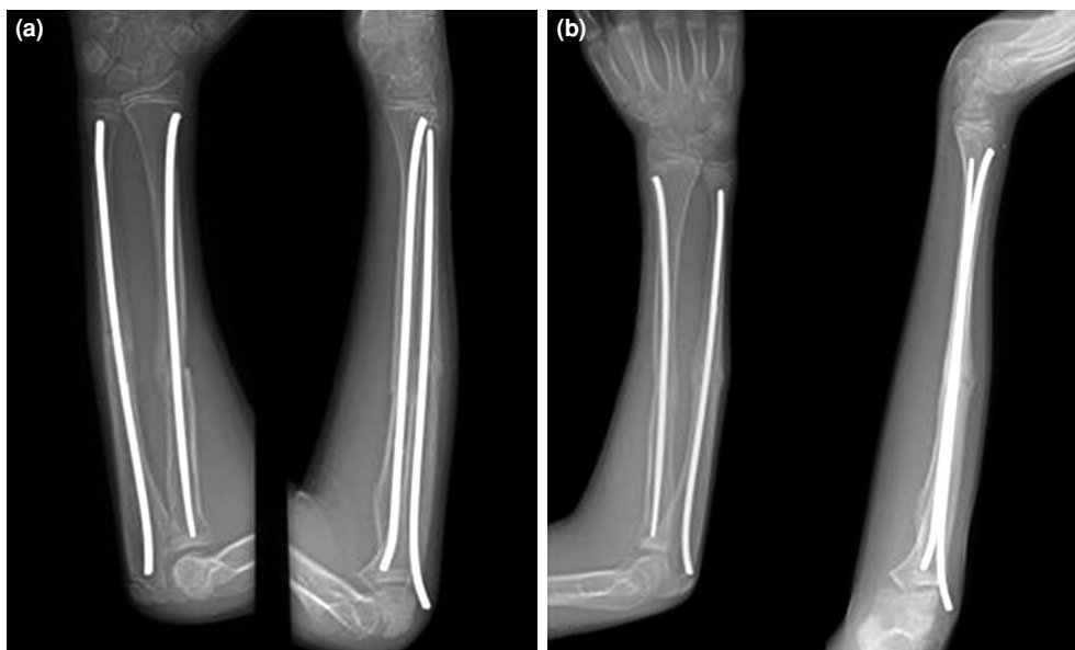
FIGURE 3. Examples of union. (a) At minimum threshold for union and (b) when >90% of reviewers considered union.

forearm fractures. Radiological fracture consolidation is achieved at seven to eight weeks. [23-25] There is no consensus in the definition of delayed fracture union. [2] Delayed union rates in forearm shaft fractures treated with elastic intramedullary nailing have been reported to be between 1.9 and 4.4%. [26] In addition, nonunion rates have been reported to be between 0.5 and 1%. 19 Mid- and proximal third fractures have higher nonunion rates than distal third fractures. [27] In this study, we evaluated the ability of RUST and