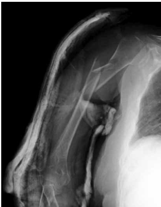
Figure 1. Plain radiograph demonstrating proximal-middle third humeral shaft fracture.

The patient had a 12-B2 type fracture according to the Arbeitsgemeinschaft für Osteosynthesefragen/Orthopaedic Trauma Association (AO/OTA) classification of diaphyseal humeral fractures which designates the humerus in three parts: proximal, diaphyseal and distal, and PM-I type fracture (P and M stand for proximal and middle third of humeral shaft and the letter I for intermediate fractures with one or two sizable bony fragments) according to a more recent classification system reported by Garnavos et al. [6] The pros and cons of these systems