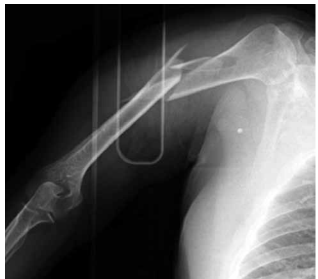
Figure 2. Plain radiograph demonstrating proximal-middle third humeral shaft fracture.

At the six-month follow-up visit, all sensory and motor functions of the nerve were fully recovered. In addition, radiographs demonstrated good healing at the fracture site (Figures 6, 7).