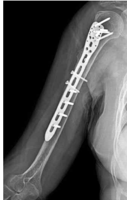
Figure 7. Plain lateral radiograph showing good healing at fracture site.

A renowned essential step in decision-making is an accurate classification of the fracture. A widely used system for classification of long bone fractures is AO/OTA, which was presented in 1990. [13] Our patient had a 12-B2 type fracture according to AO/OTA classification. AO/OTA classification, although it is widely known and used, has received criticism for having low inter- and intra-observer variation agreement and reliability. [14] We experienced the same issue while classifying our patient's fracture since it involved two zones of the humeral shaft: proximal and middle third. According to a recent classification by Garvanos et al., [6] which is a supplementation of the AO/OTA classification, the patient had PM-I type humeral shaft fracture. In this system, the letters P and M stand for proximal and middle third of humeral shaft and the letter I for intermediate fractures with one or two sizable bony fragments. Garvanos et al. [6] reported that fractures extending to multiple zones like PM type and presence of