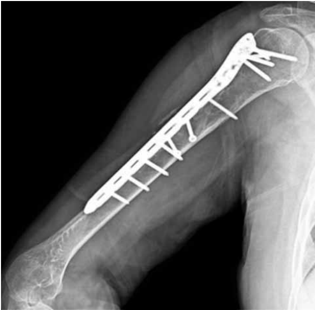
Figure 6. Plain anteroposterior radiograph showing good healing at fracture site.

As mentioned before, we had to decide about the choice of treatment method. First of all, neither long oblique fracture extending to the proximal humerus nor partial radial nerve palsy were indications for operative management of diaphyseal humeral fractures. [13] Moreover, proximal third, long oblique fracture was a relative indication for nonoperative management of diaphyseal humeral fractures. [13] Thus, there were both nonoperative and operative options available regarding the basic orthopedic knowledge.