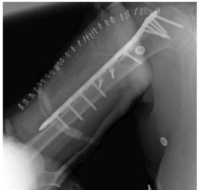
Figure 5. Plain radiograph showing reduction and fixation with an anatomical proximal humerus plate.

nerve injury”, [12] it is still a matter of debate as to what should be done for cases with no distinct indications for surgery.