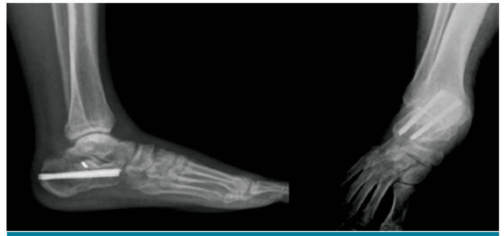
FIGURE 3. Postoperative anteroposterior and lateral views of closed reduction using dual-point distraction and percutaneous fixation group.