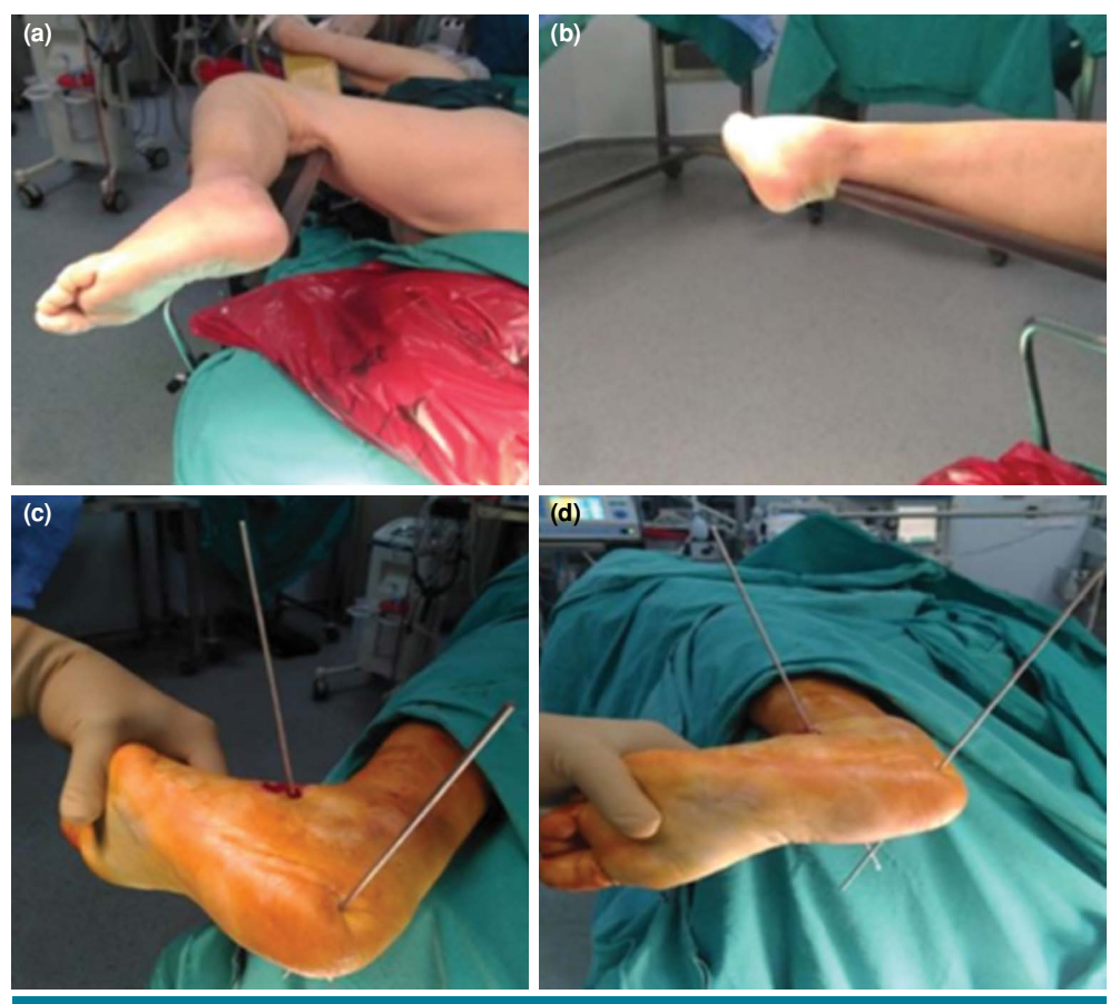
FIGURE 1. (a, b) All patients were placed in lateral decubitus position with injured foot placed on a leg holder in an upper and strictly horizontal position. (c, d) Two Kirschner-wires were used for distraction, with first pin inserted in anterior process of talus and second pin inserted in distal plantar region of tuber calcaneus.

joint; thereafter, a dorsal turn of 1 cm was performed. The whole layer of the skin flap was separated to fully expose the lateral wall of the calcaneus, subtalar joint and calcaneocuboid joint. A K-wire was drilled to restore the articular surface and fracture reduction. An artificial bone was used to fill the bone defects. When the reduction was satisfactory, as observed by fluoroscopy, a steel plate was inserted for ORIF. The fracture end, calcaneal plate and screw location were confirmed using fluoroscopy (Figure 4).