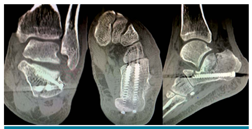
FIGURE 4. Postoperative computer tomography images of closed reduction using dual-point distraction and percutaneous fixation group.